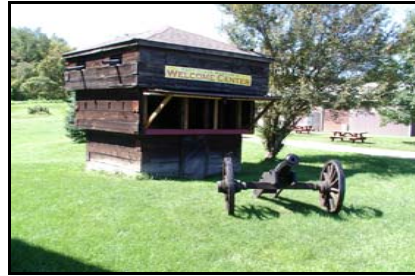
Welcome center at Fort Plain