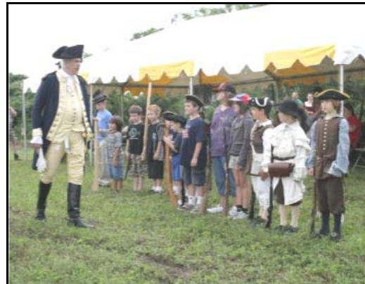
Washington addressing the new recruits