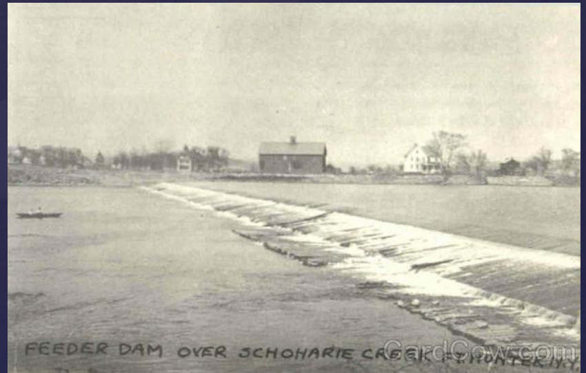
FEEDER DAM OVER SCHOHARIE CREEK FT. MONTELL N.Y.