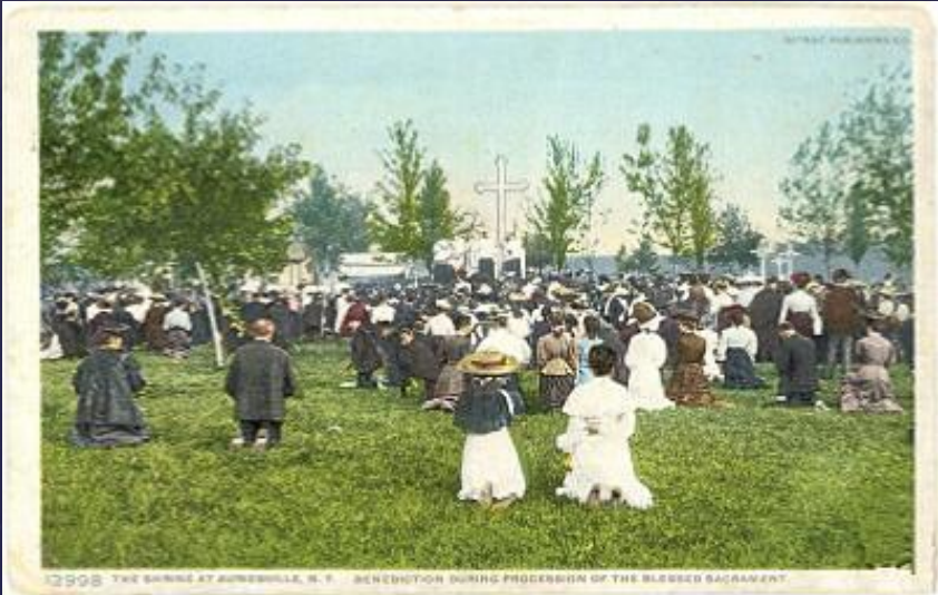
12908 THE BARNING AT RICHMOND, N. C. BENEDECTION DURING PROCESSION OF THE BLESSED SACRAMENT