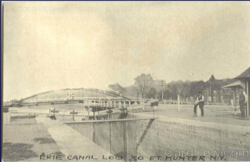
ERIE CANAL LOCK 30 FT. HUNTER N.Y.