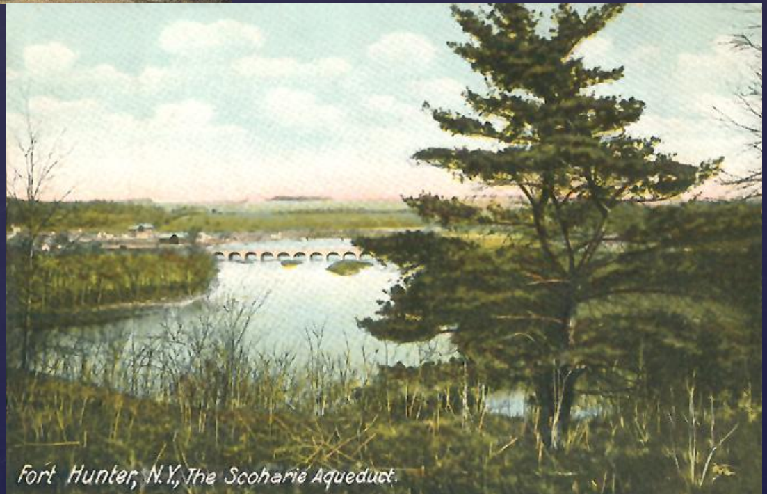
Fort Hunter, N.Y., The Schoharie Aqueduct.

Published for Schoeffler's Book Store, Amsterdam, N. Y.