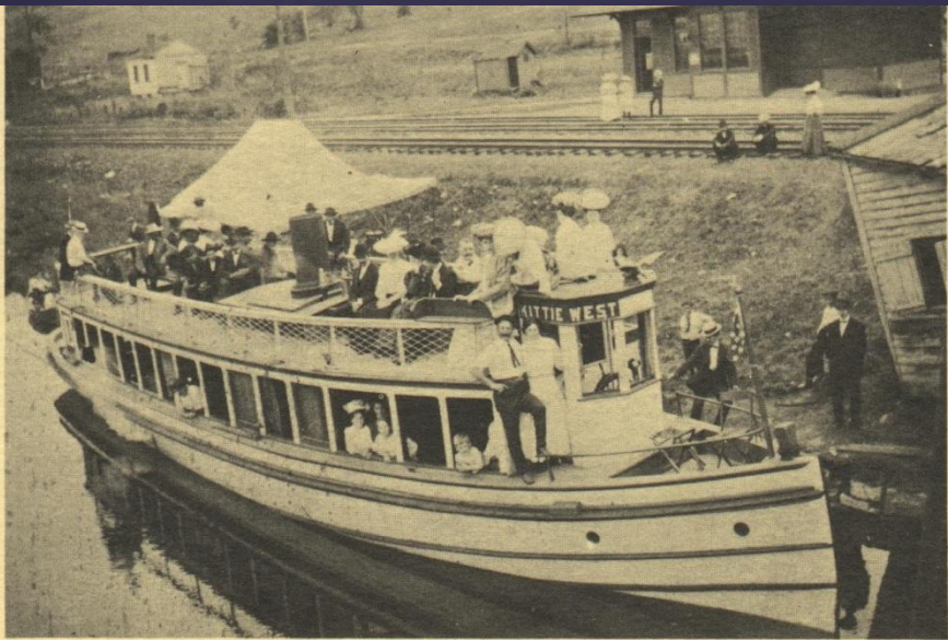
Excursion boat (Kittie West) on the canal at Auriesville